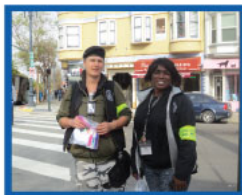
Hot Team members